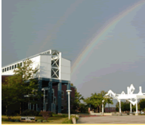
Engineering and Technology Building